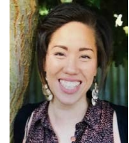
Miss S Black Support